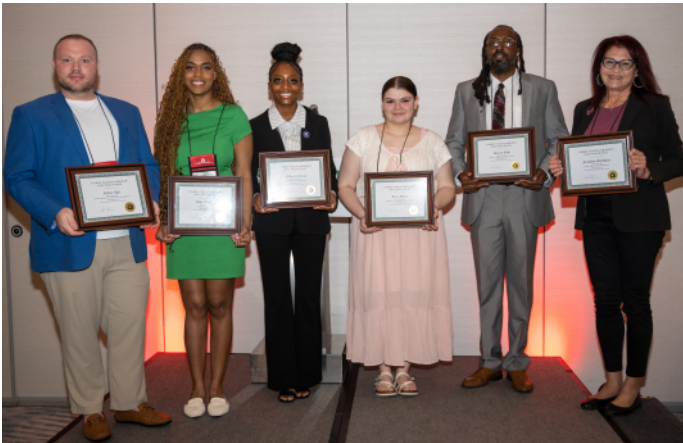
2025 CARH Scholarship Recipients

8:30 -10:00 a.m. CARH Scholarship Foundation Awards Breakfast The Board of Directors of the CARH Scholarship Foundation will present scholarships to eight exceptional students from CARH-member properties. Attendees will not want to miss this event and show the rural housing industry's support for these outstanding students.