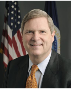
Thomas J. Vilsack United States Department of Agriculture

Secretary Vilsack was confirmed as the 32 nd Secretary of the U.S. Department of Agriculture on February 23, 2021 by the U.S. Senate. He served in the same position for eight years under President Barack Obama.