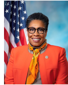
Marcia L. Fudge Department of Housing & Urban Development

Secretary Marcia L. Fudge was confirmed as the 18th Secretary of the U.S. Department of Housing and Urban Development on March 10, 2021, by the U.S. Senate. Throughout her career, Secretary Fudge has worked to help low-income families, seniors, and communities across the country.