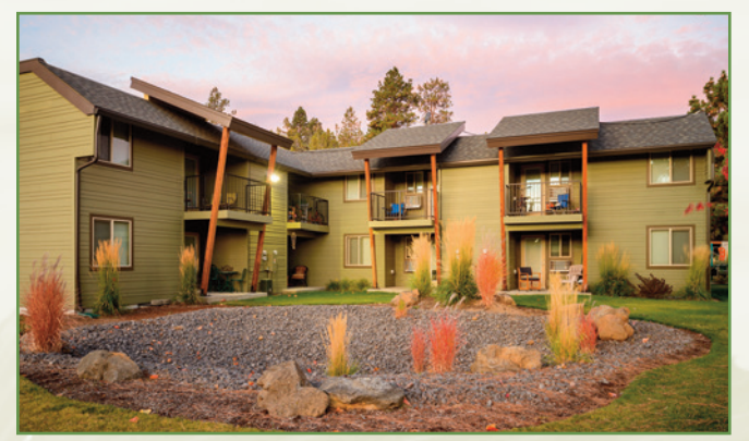
Crest Butte Apartments, Bend Oregon -- Viridian Management (Manager) /Chrisman Development (Developer)

This Committee will discuss preservation and operations issues facing owners and developers in this ever-changing regulatory and legislative environment. We will discuss ongoing efforts and further recommendations for Congress and the Administration to address the aging portfolio, maturing mortgages and permanent decoupling of the Section 521 program from the Section 515 loan. Increased construction costs, delays in supply chains and employment issues will be discussed. Further legislative changes and enhancements to the housing credit and bond programs will be outlined. If time allows, this Committee will also review the new Simple Transfer Pilot Program rule. The Committee should be prepared to recommend its top priority issues for action to the CARH board of directors.